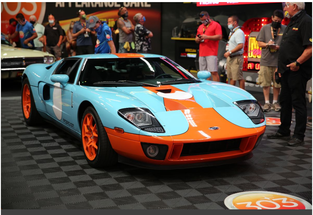
2006 Ford GT Heritage Edition Supercharged 5.4L/550 HP, 3,600 Miles (Lot S115) sold at $412,500