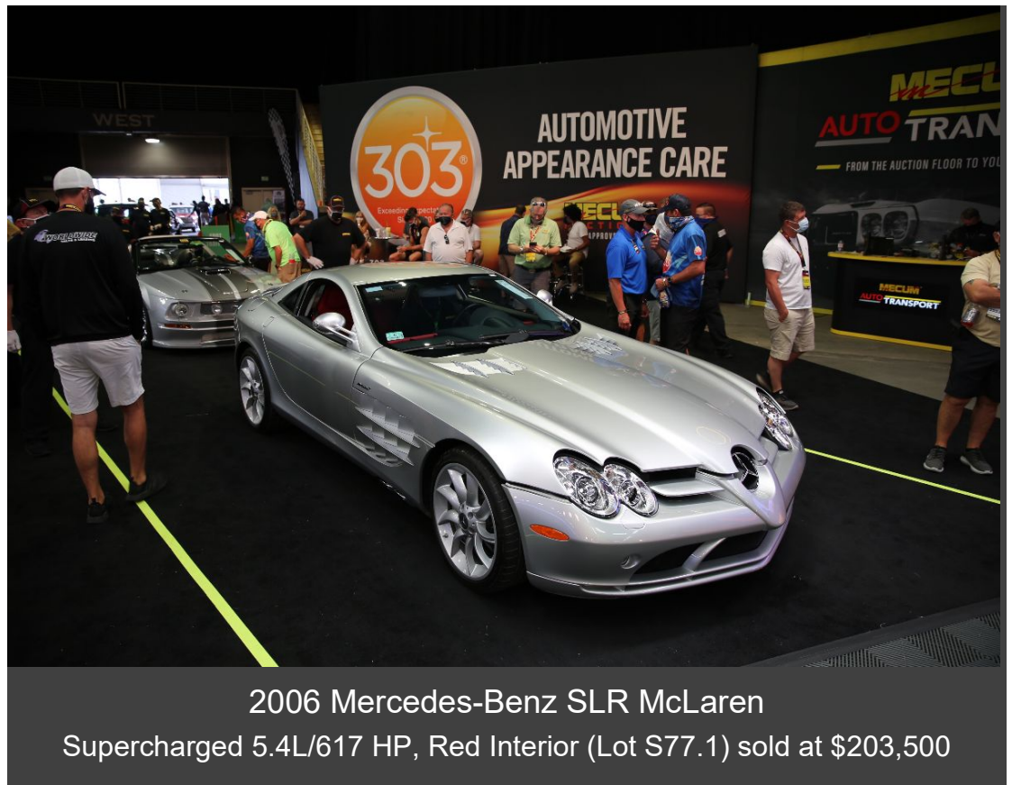
Supercharged 5.4L/617 HP, Red Interior (Lot S77.1) sold at $203,500